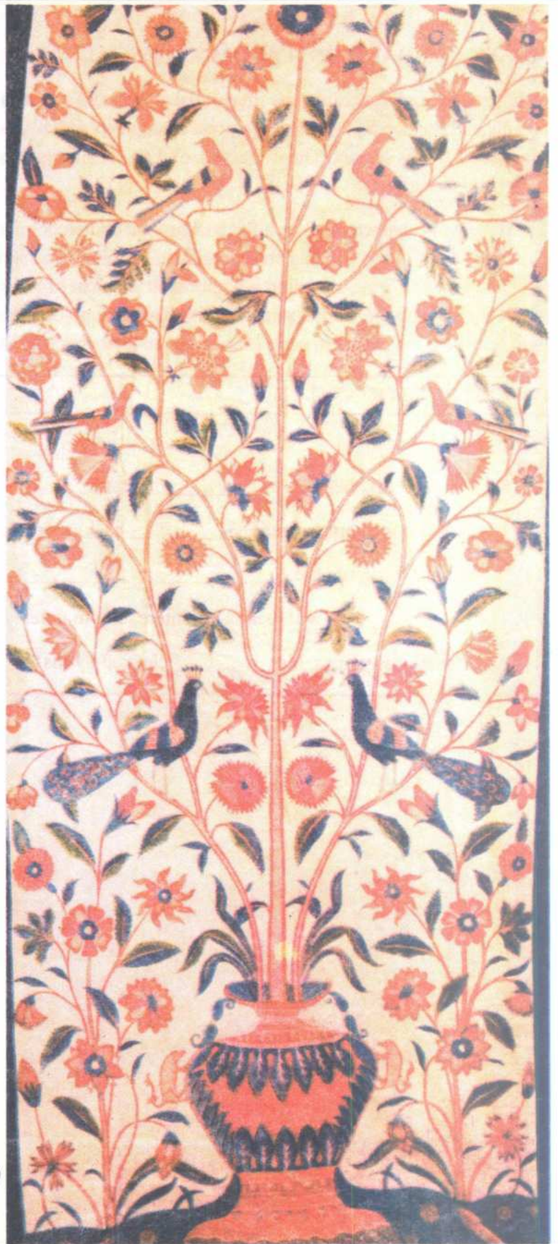
Kalamkari (Andhra Pradesh)