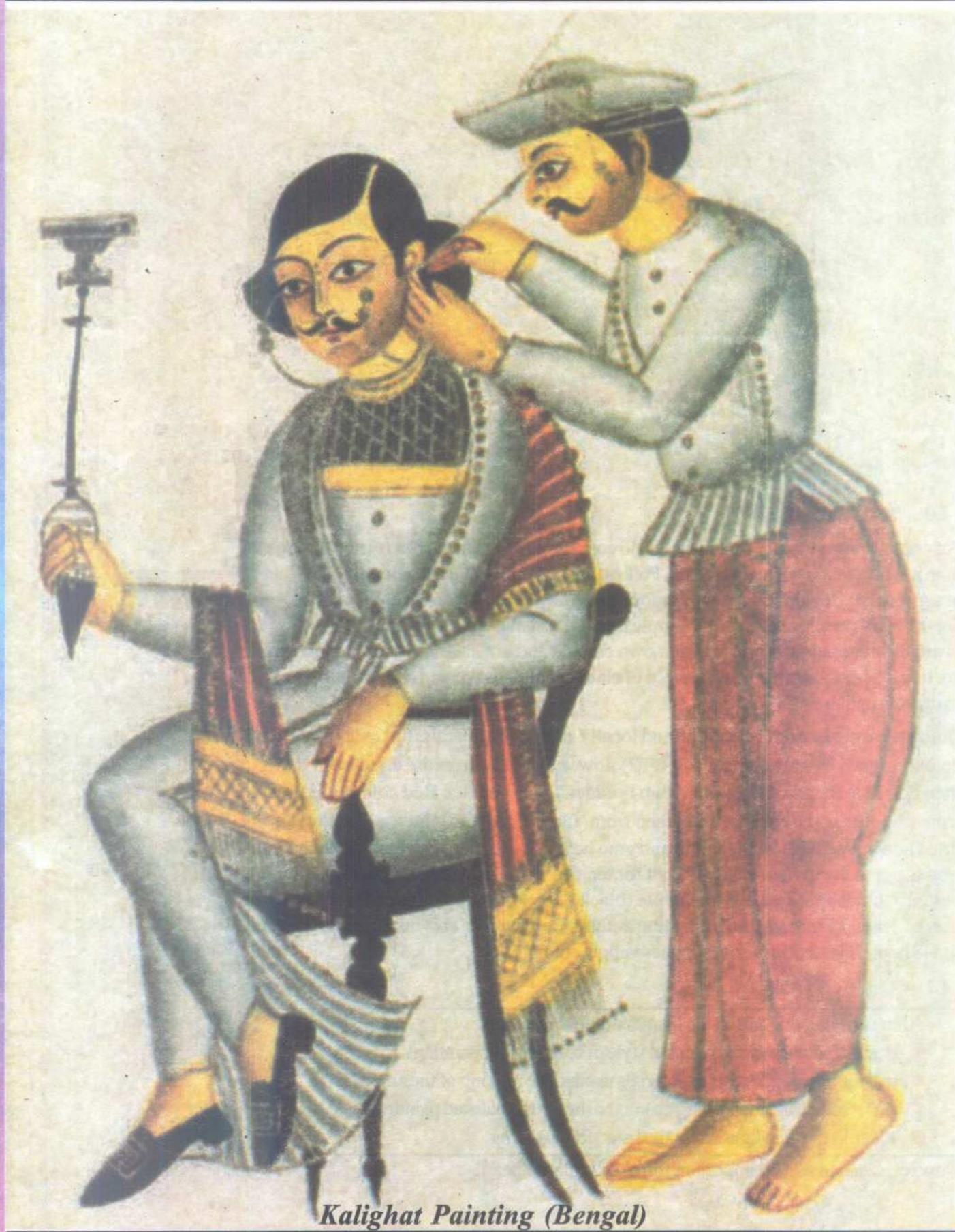
Kalighat Painting (Bengal)