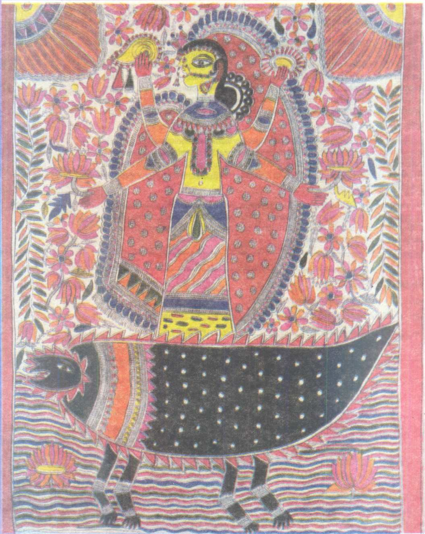
Madhuvani (Mithila, Bihar)